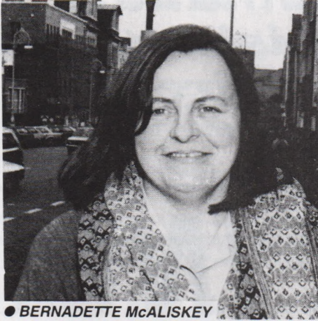
● BERNADETTE McALISKEY